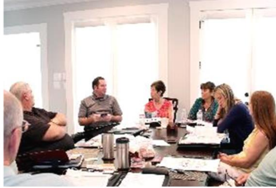
The conference room in Houston.