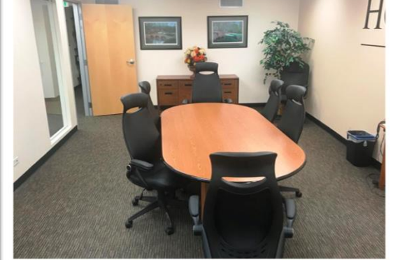
Conference room in Arvada.