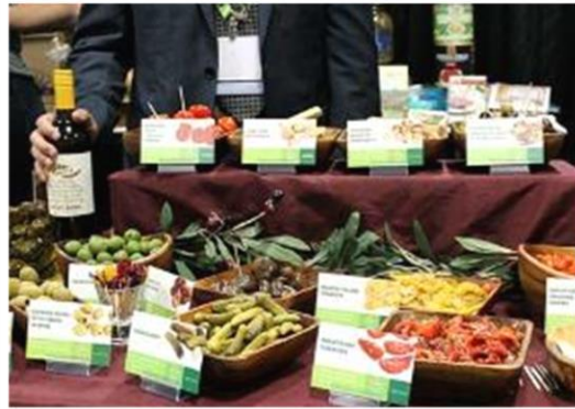
One of the many foods shows.