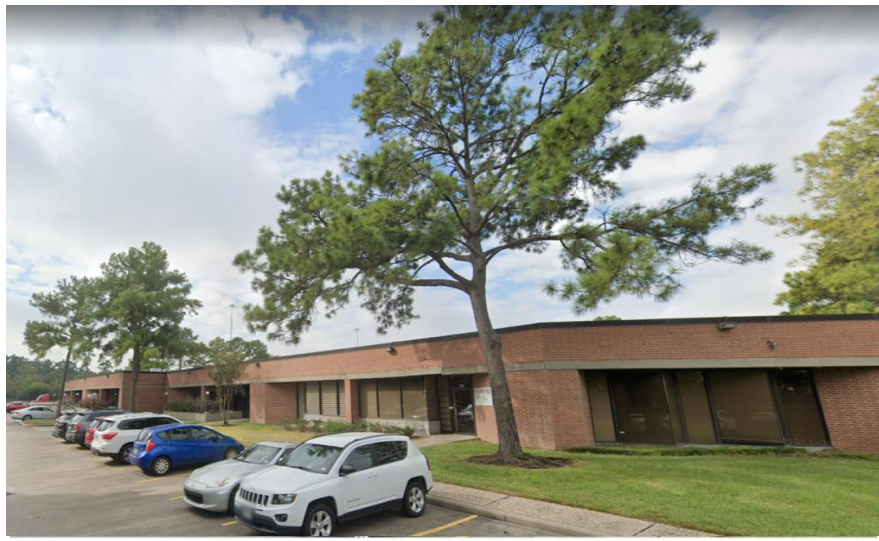
US&S Houston office Houston, TX.