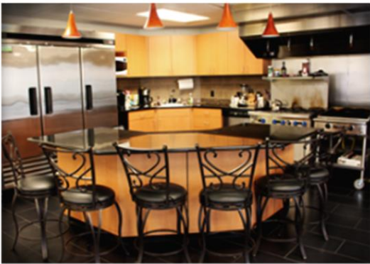
The gourmet kitchen in Arvada.