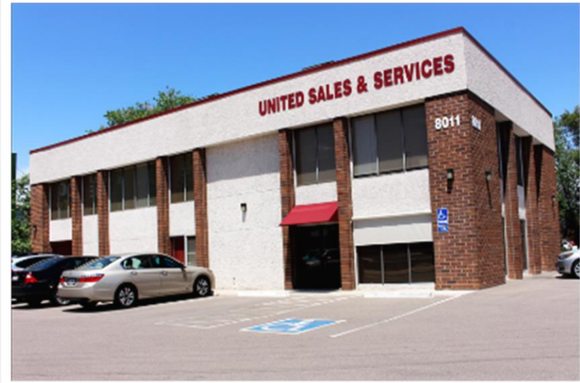
US&S Denver office in Arvada, CO.